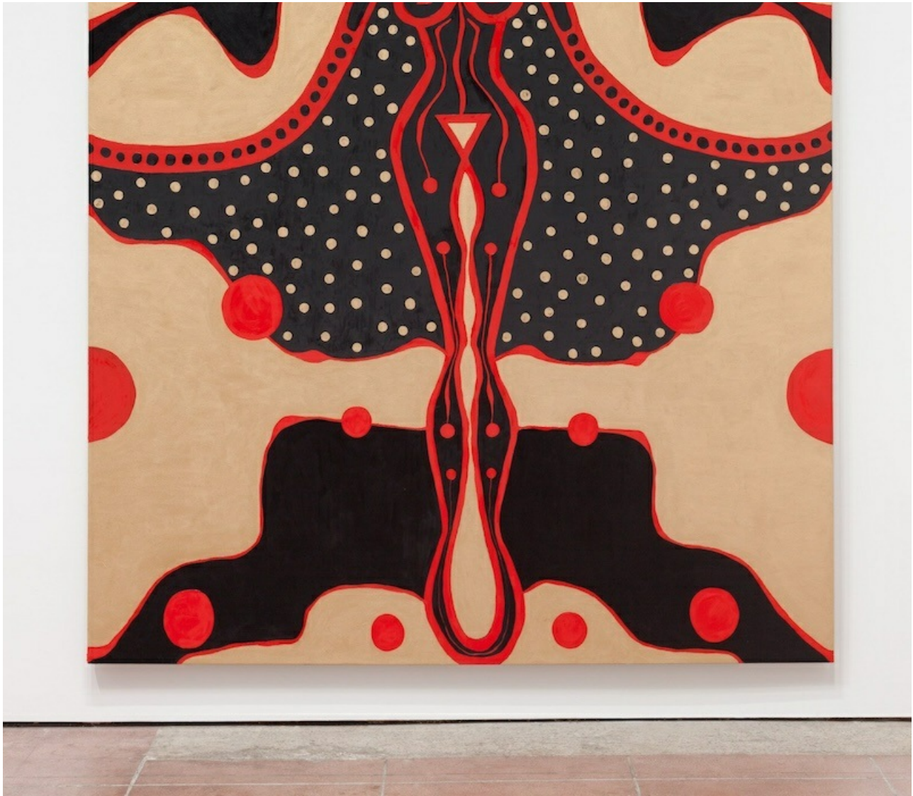
JOJO ABOT, Ta Kpe Kpe , 2020, oil on canvas, 110 x 74 in. (279.4 x 188 cm)

As you speak about harmony, I picture a spherical shape, a container, but also unending. In the realm of the exhibition and possibilities, how did you decide what to make specifically since you have an interdisciplinary practice?