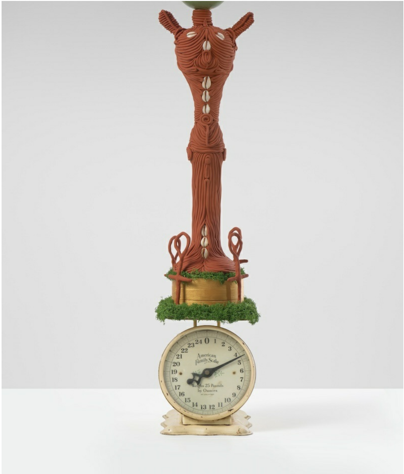
JOJO ABOT, Weight of the world , 2023, clay, shells, wood, paper, foliage, metal, 34 x 7 x 8 1/2 in. (86.4 x 17.8 x 21.6 cm)