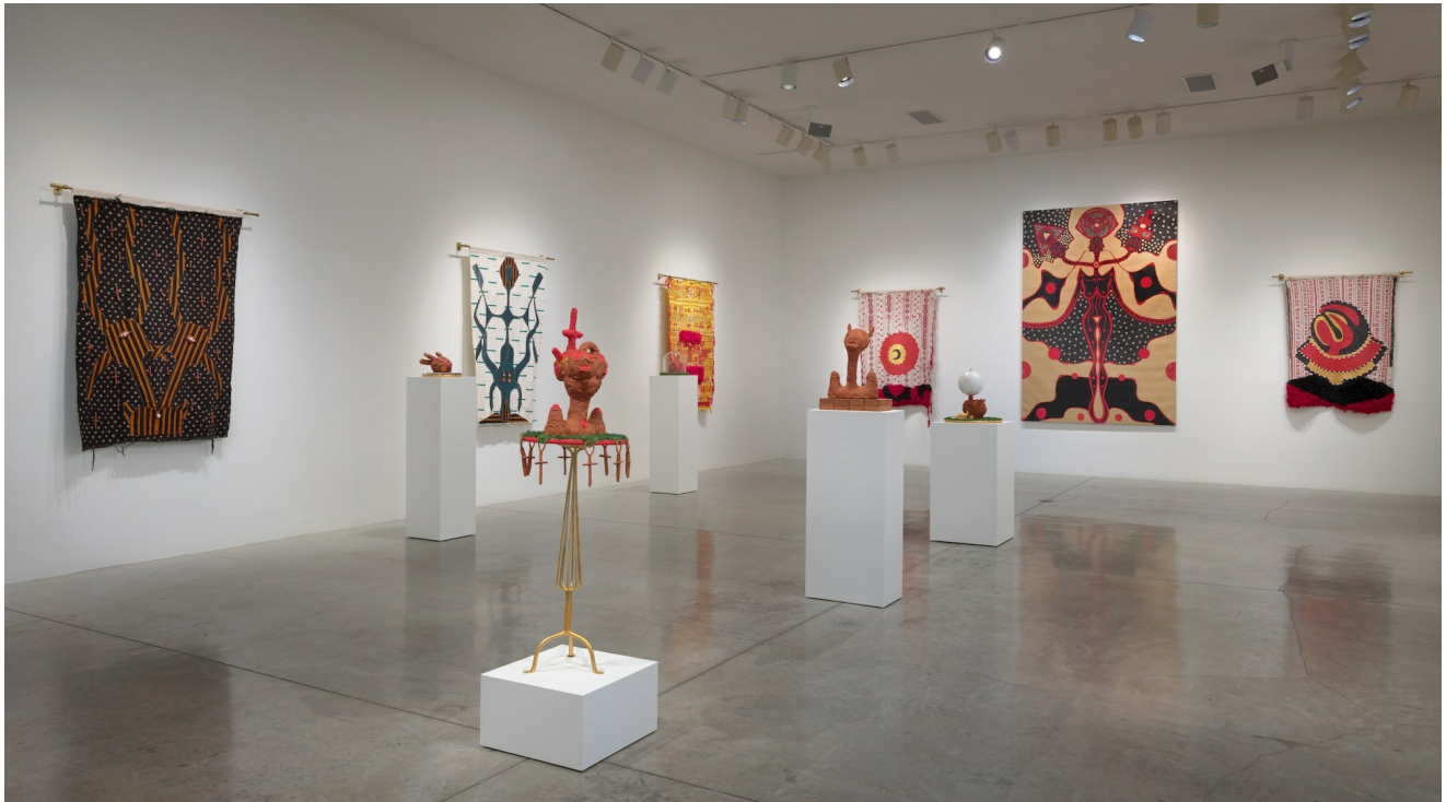
‘A GOD OF HER OWN MAKING’ installation