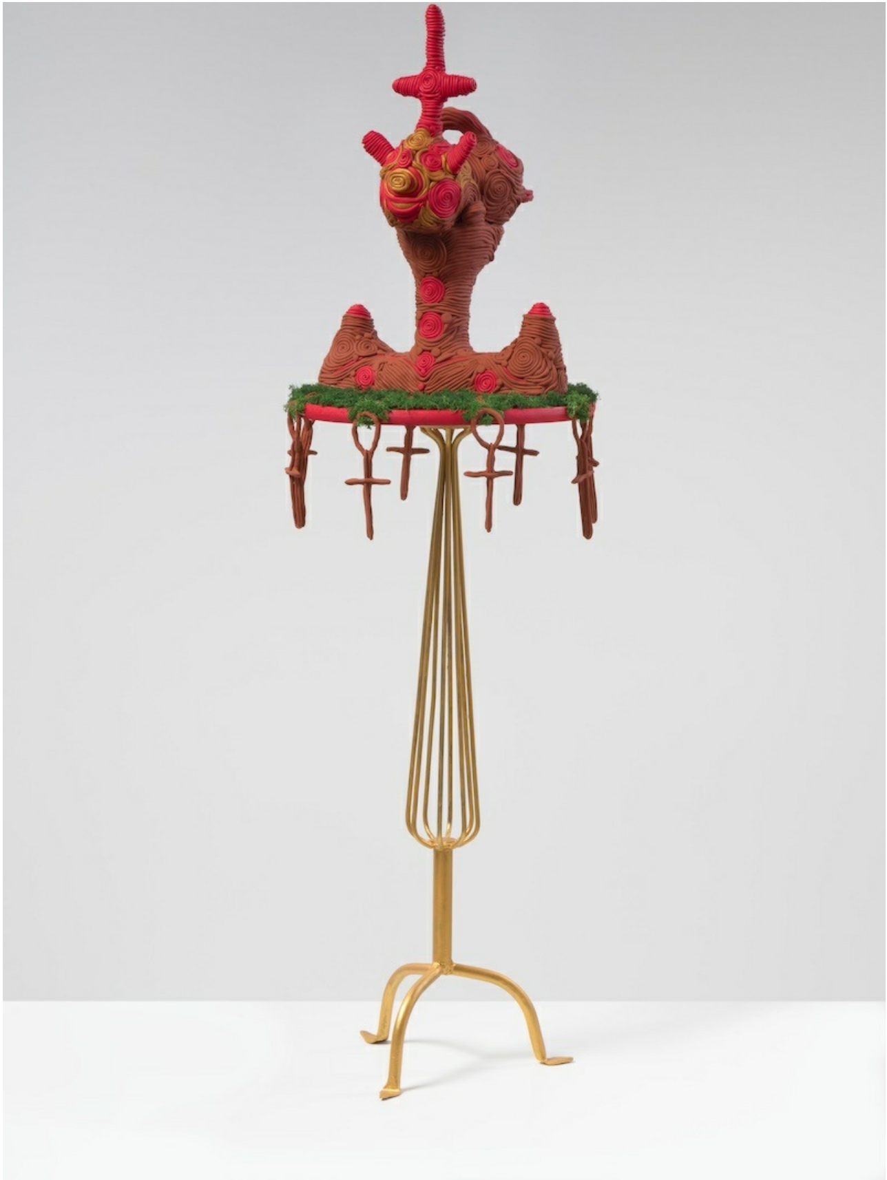
JOJO ABOT, Three heads are better than one , 2023, clay, foliage, metal, 52 1/2 x 17 x 17 in. (133.4 x 43.2 x 43.2 cm)